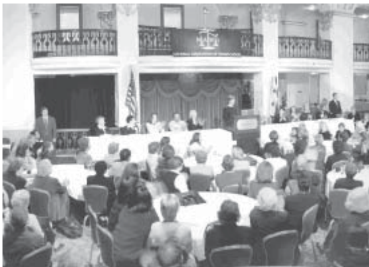
Laura Bush addressing conference attendees on Friday morning.

Senator Mary Landreiu (D-LA) and U.S. Supreme Court Justice, Ruth Bader Ginsburg. Justice Ginsburg, long a NAWJ member, received NAWJ's Honoree of the Year award at the dinner.