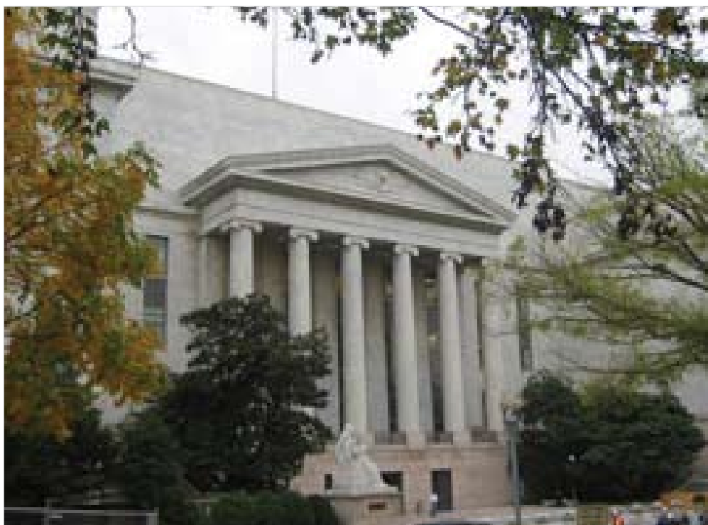
Rayburn House Office Building

The Congressional Caucus for Women's Issues has undergone several structural changes since its founding in 1977, and today includes within its membership all women currently serving in the House of Representatives. ■