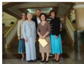
Hon. Celeste F. Bremer with the mediation Training Team in Kuala Lumpur, Malaysia August, 2007.