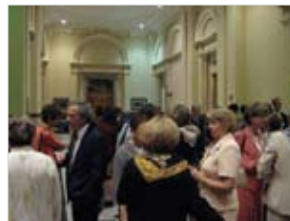
NAWJ District One Annual Dinner Meeting attendees.