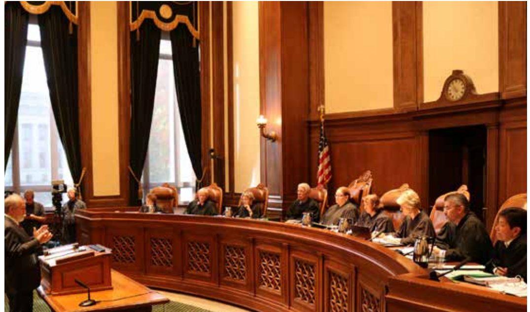
Current members of the Washington State Supreme Court hearing oral argument for the case of McCleary, et al. v. State of Washington on October 24, 2017 in the Courtroom of the Temple of Justice.