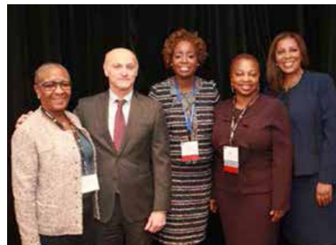
Scenes from the Midyear Meeting in Brooklyn.